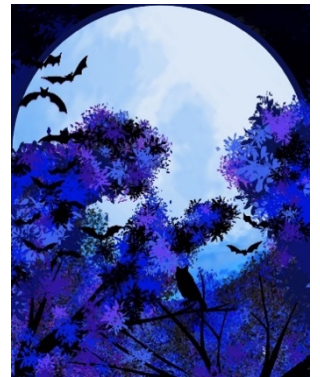
What Flies at Night by Allison Orzech