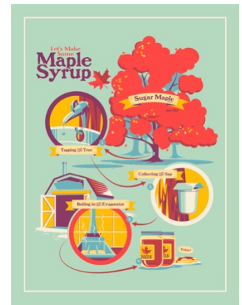
Let's Make Maple Syrup by Lindsey Prentice