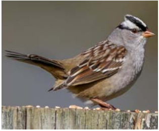
White-Crowned Sparrow (W)

Size: Large sparrow w/ small bill & long tail. Head can be distinctly peaked or smooth & flat. Slightly larger than a song sparrow.