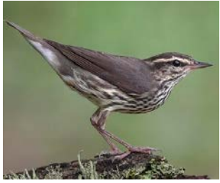
Northern Waterthrush (M)

Size: Large but trim. Short, fine bill, short tail, and long legs.