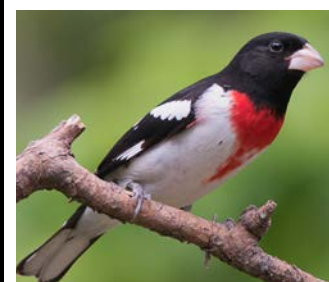
Rose-Breasted Grosbeak (M)

Song: Begins with one+ short, sharp chip note(s) and continues as a rich and highly variable warble.