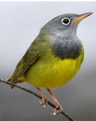
Connecticut Warbler (M)

Song: Series of slurred two-note phrases followed by two lower phrases.