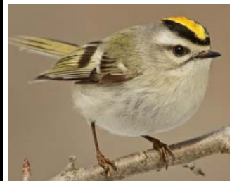
Golden-Crowned Kinglet (W)

Song: Serene series of flutelike notes with similar phrases repeated at varying pitches.