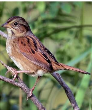
Swamp Sparrow (W)

Size: Medium-sized w/ short, conical bill. Moderately long tail. Overall very similar to Song Sparrow.