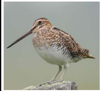
Wilson's Snipe (M)

Size: Medium-sized, pudgy w/ short, stocky legs. long straight bill. Rounded head w/ short tail.