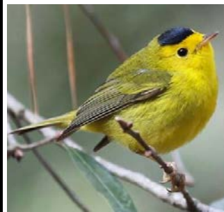
Wilson's Warbler (M)

Size: Small w/ long thin tail & small thin bills. Round-bodied and large-headed.