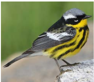
Magnolia Warbler (M)

Song: Series of high see-weet notes and a lower short trill.