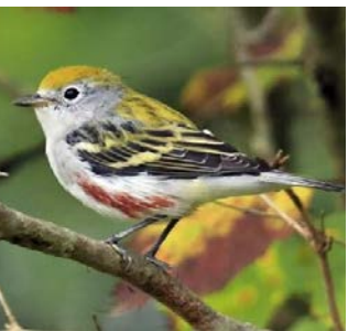
Chestnut-Sided Warbler (M)

Song: Short series of high notes followed by squeaky ascending trill, ending on very high note zip zip zip zip zip zip zip titititi tseeeee