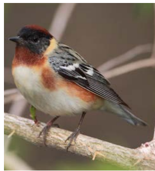
Bay-Breasted Warbler (M)

Size: Small w/ fine pointed bill. Rather long wings & tail.