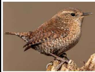
Winter Wren (W)

Size: Plump, round ball. Stubby tail usually held straight up. Small thin bill. Larger than a hummingbird, smaller than a Carolina Wren.