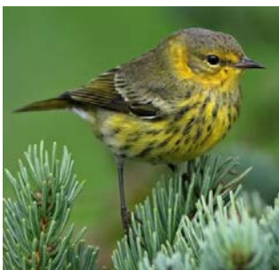
Cape May Warbler (M)

Song: Short, whistled weety-weety-weeteo .