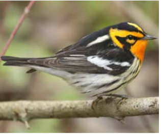
Blackburnian Warbler (M)

Song: Hoarse zeee zeee zee-zo-zee. And another often written as trees, trees, whispering trees.