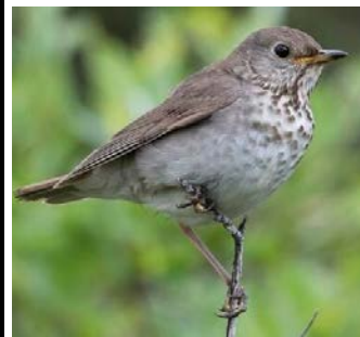
Gray-Cheeked Thrush (M)

Song: Ascending spiral of varied whistles.