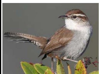
Bewick's Wren (M)

Song: Dry che-bek accented on second syllable. Usually in a rapid series.