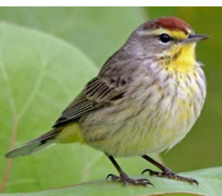
Palm Warbler (M)

Size: Large w/ fuller belly for a warbler. More upright posture. Tails & legs longer than most warblers.