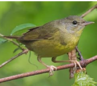
Mourning Warbler (M)

Song: Starts w/ large emphatic notes, ending in lower, rapid notes.