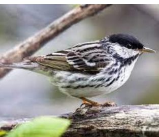
Blackpoll Warbler (M)

Song: Series up to 10 high-pitched double notes of see, szee , or teesi notes on one pitch.