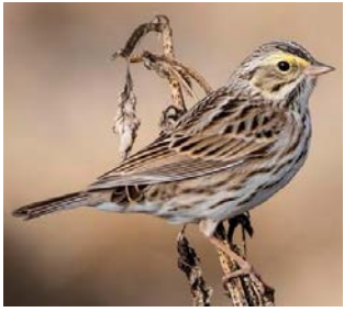
Savannah Sparrow (M)

Size: Medium-sized w/ short, notched tails. Small head for the plump bodied. Crown feathers often flare to make a small peak.