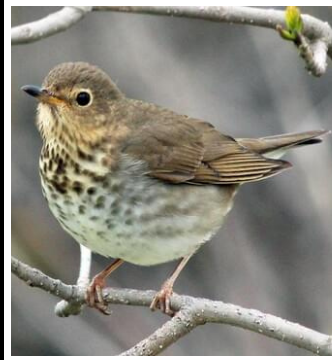
Swainson's Thrush (M)

Size: Slim w/ round heads and short straight bills. Long wings and medium-length tail.