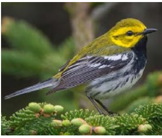
Black-Throated Green Warbler (M)

Size: Medium-sized, plump and large-headed. Thick, straight bill w/ shortish tail.