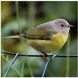
Nashville Warbler (M)

Size: Small songbird, compact w/ round head, plump body, and shortish tail. Fine, straight, and pointed bill.