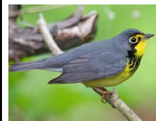
Canada Warbler (M)

Song: Rapid, variable series of chee notes.