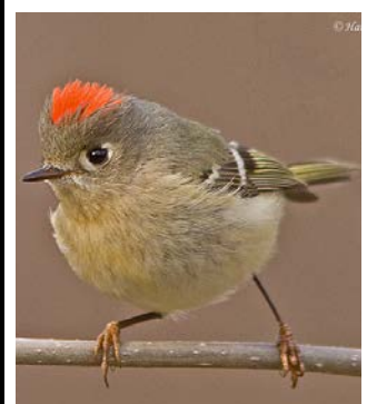
Ruby-Crowned Kinglet (W)

Song: Almost inaudibly high series of tsee notes accelerating into a trill.