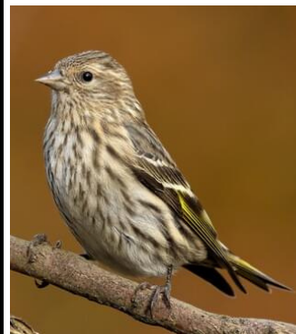
Pine Siskin (W)

Size: Small w/ sharp pointed bills. Short notched tails. Forked tails & pointed wingtips in flight.