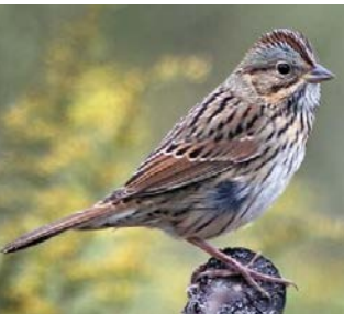
Lincoln's Sparrow (M)

Song: Begun with two to three chip notes followed by two buzzy trills.