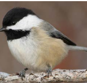
Black-Capped Chickadee (W)

Song: Squealing, territorial repeated quee-ah quee-ah .