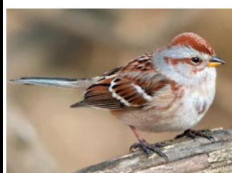
American Tree Sparrow (W)

Size: Small, round-headed, often fluff feathers and appear chubby. Small bills and long thin tails for sparrows.