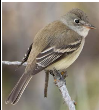
Least Flycatcher (M)

Call: Harsh two-syllable ski-ape call when flushed. Wheet call from perching males when breeding.