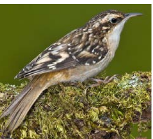
Brown Creeper (W)

Song: Clear whistled fee-bee or fee-bee-bee with higher-pitched first note.